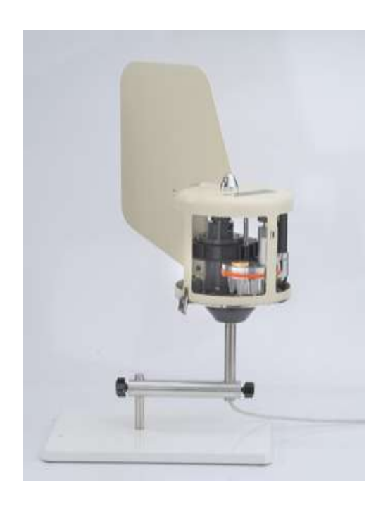
Figure 2. Burkard multi-vial 8 day air cyclone sampler

In commercial Brassica cropping systems a Microtiter immunospore trap was operated as a reference trap to validate the quantitative readings made using the developed light leaf spot and powdery mildew lateral flow system. Air sampling systems show the potential to designate the likely onset of disease occurrence in field Brassicas.